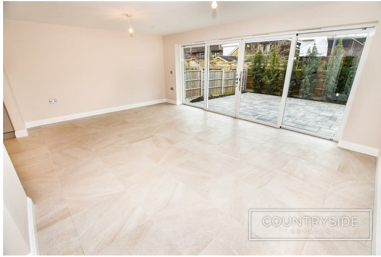
Bedroom One 16'8" x 11'4" (5.08m x 3.45m )